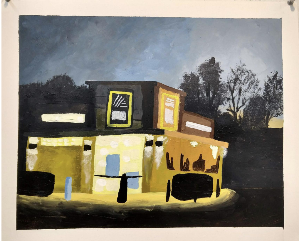
Artist Withheld, Acrylic on Primed Paper, 2022