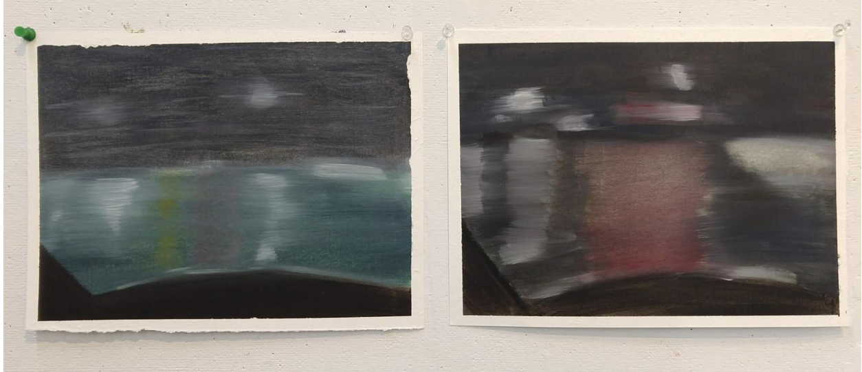
Artist Withheld, Oil on Primed Paper, 2022