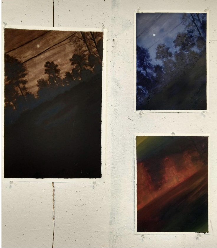
Artist Withheld, Oil on Primed Paper, 2022